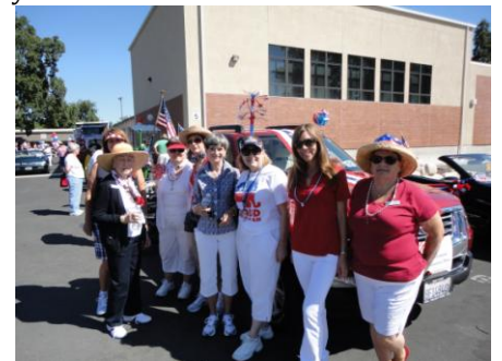
BRW at the Danville July 4 th Parade